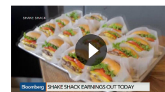
Shake Shack Ready to Serve Up First Earnings Report