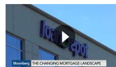
Non-Banks Squeeze Banks in Evolving Mortgage Market