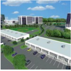
Rendering of Hutchinson Metro Expansion